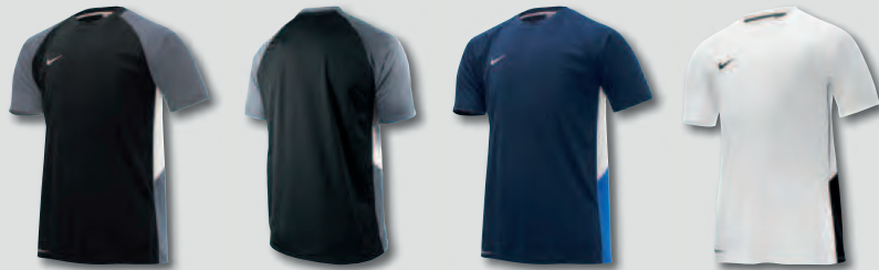
010 Black/Light Graphite/White/White

Get the fit and ventilation you need to practise your moves in the Nike Team Poly Training Football Shirt. • Rib crew-neck. • Contrast sleeves. • Contrast mesh panels at side-seams. • Fabric: Dri-FIT 100% polyester.