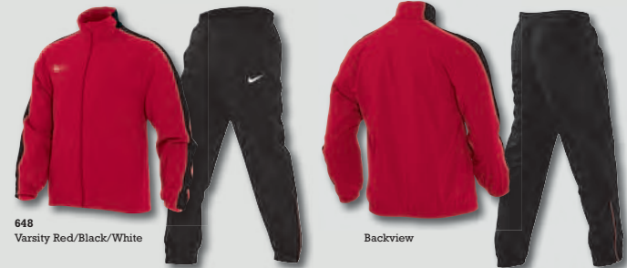
648 Varsity Red/Black/White

Water-repellent track jacket and pull-on trousers designed to keep your blood pumping before the match. • Mock-neck at track jacket. • Contrast stripes at neck, shoulders and sleeves. • Side slit pockets. • Elastic cuffs and hem. • Elastic waist with drawcord at trousers. • Zip vents at hem. • Fabric: 100% polyester.