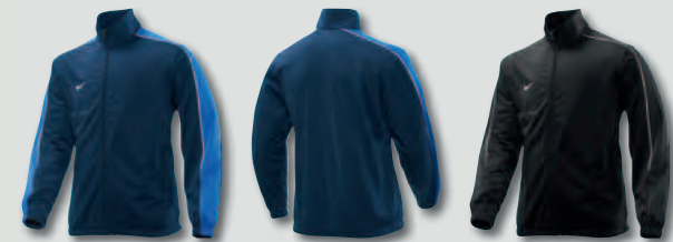
451 Obsidian/White/Royal Blue/ White

Run the pitch with sweat-wicking power and prestige in the Nike Team Knit Football Warm-Up Jacket, a lightweight fit and athletic look that matches your pre-game intensity. • Mock-neck. • Side-zip pockets. • Contrast piping at sleeves. • Fabric: Dri-FIT 100% polyester.