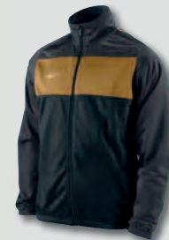
010 Black/Antracite/ Jersey Gold/White