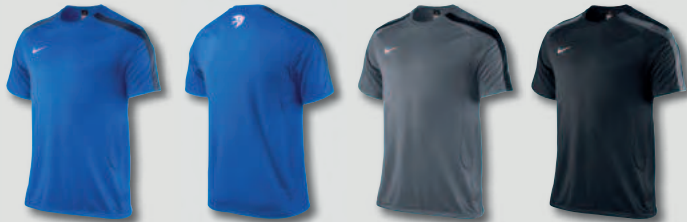
463 Royal Blue/Obsidian/White Backview 001 Light Graphite/Black/White 010 Black/Light Graphite/White

Lightweight design so nothing slows you down. • Contrast inset panels at shoulders. • Mesh side panels. • Double layer mesh back panel. • Embroidery at centre back neck. • Fabric: Dri-FIT 100% polyester.