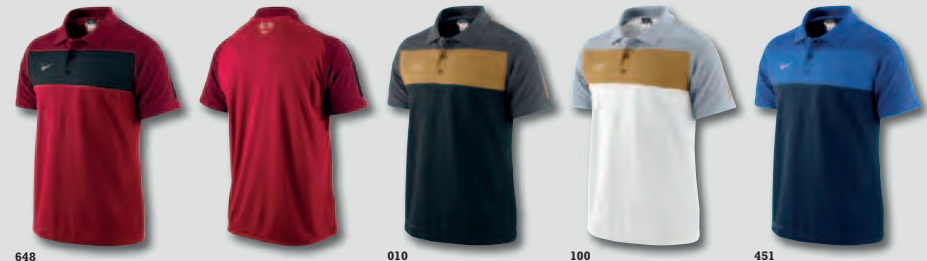
648 Varsity Red/Team Red/ Black/White

Be at your best in the Nike Federation II Football Polo Shirt, a classic athletic design upgraded with high-performance fabric for the ultimate comfort. • Rib collar. • Button placket. • Contrast panels at shoulders and centre front. • Fabric: Dri-FIT 65% cotton/35% polyester.