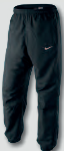
010 Black/Antracite/ White