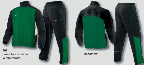
302 Pine Green/Black/ White/White

Water-repellent track jacket and pull-on pants that offer a lightweight fit and colour-block design. • Mock-neck at track jacket. • Mesh panel at side. • Elastic waist with drawcord at trousers. • Mesh panels at back waist and back knee. • Zip vent at hem. • Mesh lining. • Fabric: 100% polyester.