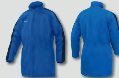
463 Royal Blue/Black/White

Designed to keep you warm, the Nike Team Long Football Jacket is an insulated outer layer with a sporty look and a mobile raglan sleeve design. • Mock-neck. • Contrast stripe at shoulders and sleeves. • Interior pocket at chest. • Interior drawcord at waist. • Fabric: 100% polyester.