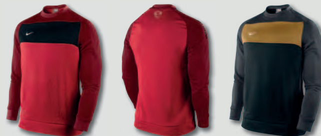
648 Varsity Red/Team Red/Black/White

Get the warmth and insulation you need in the Nike Federation II Football Sweatshirt, a footballer's favourite that gives you all you need to get to and from the pitch. • Rib crew-neck, cuffs and hem. • Contrast panels at shoulders and centre front. • Screenprint at centre back neck. • Fabric: 100% polyester.