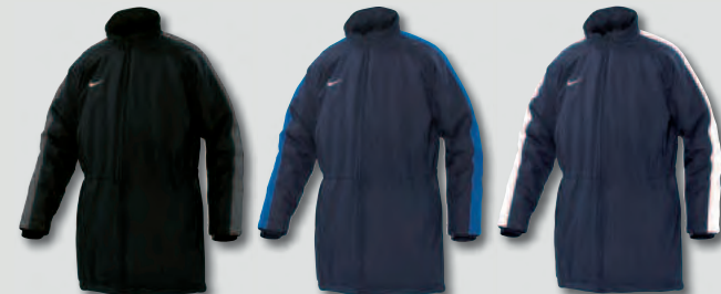
010 Black/Light Graphite/ White