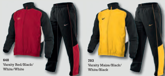
648 Varsity Red/Black/ White/White