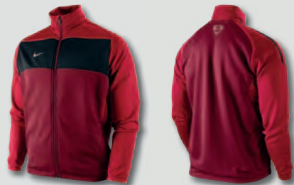
677 Team Red/Varsity Red/Black/White

Play tough and look tougher in the Nike Federation Knit Football Jacket, an essential layer for warmth with high performance fabric that keeps you comfortable. • Mock-neck. • Contrast stripes at shoulders and centre front. • Side-zip pockets. • Elastic cuffs and hem. • Fabric: Dri-FIT 100% polyester.