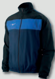
451 Obsidian/Black/Royal Blue/White