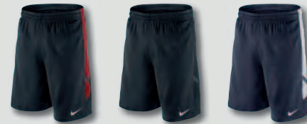
011 Black/Varsity Red/White 013 Black/Black/White 451 Obsidian/White/White