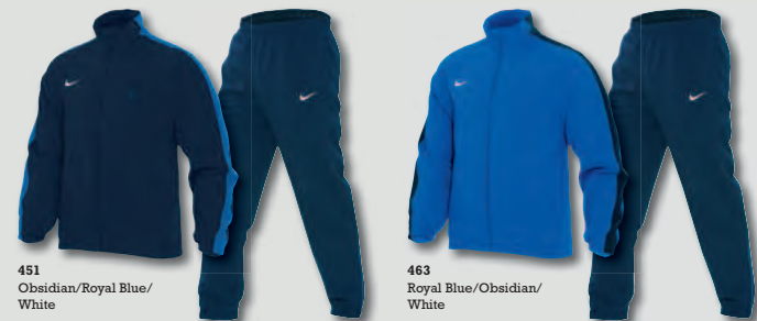
451 Obsidian/Royal Blue/ White