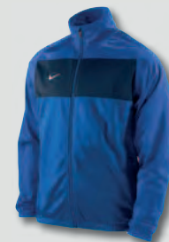
463 Royal Blue/Old Royal/ Obsidian/White