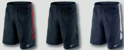
011 Black/Varsity Red/White 013 Black/Black/White 451 Obsidian/White/White