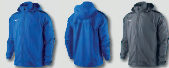
463 Royal Blue/Obsidian/White

Stay on the pitch and keep playing regardless the weather. • Packable hood and bungee cord and toggle. • Mesh-lined side-zip pockets. • Elastic cuffs. • Concealed mesh vent at centre back. • Adjustable hem with bungee cord and toggle. • Interior mesh lining. • Fabric: Storm-FIT 100% polyester.