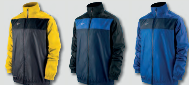
060 Antracite/Varsity Maize/ Black/White