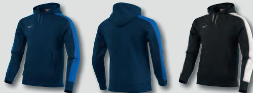
451 Obsidian/Royal Blue/ White

The Nike Team Fleece Football Hoody has a comfortable fit with a match-ready look when it's time to play your heart out. • Lined hood with drawcord. • Contrast stripe at shoulder and sleeve. • Rib cuffs and hem. • Fabric: Body: 76% cotton/24% polyester.