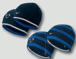
451 Obsidian/Royal Blue/White/White