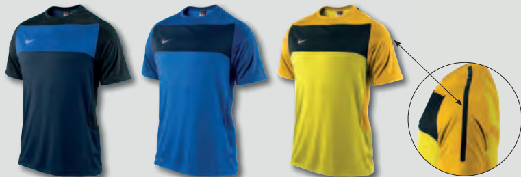
451 Obsidian/Black/Royal Blue/White