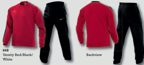
648 Varsity Red/Black/ White

Designed with insulated fabric for premium warmth and comfort. • Rib crew-neck, cuffs and hem on shirt. • Contrast panel at shoulders and sleeves. • Elastic waist with drawcord on trousers. • Cuffed hem. • Fabric: 76% cotton (5% organic)/24% polyester.