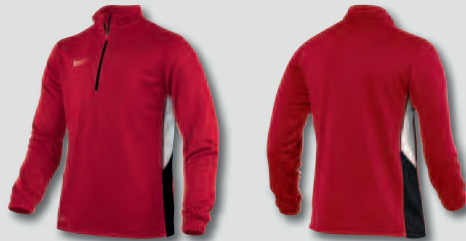
648 Varsity Red/Black/White/White

The extra layer you need on the pitch, the Nike Team Half-Zip Football Top is designed with sweat-wicking fabric and mesh panels for supreme comfort. • Mock-neck. • Half-zip placket. • Mesh panels at sides. • Fabric: Dri-FIT 100% polyester.