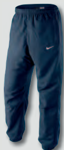
451 Obsidian/Royal Blue/ White