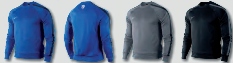
463 Royal Blue/Obsidian/White Backview 001 Light Graphite/Black/White 010 Black/Light Graphite/White

The Competition Midlayer is a top choice for you. • Rib crew-neck, cuffs and hem. • Contrast inset panels at shoulders and sleeves. • Inset panels at sides. • Embroidery at centre back neck. • Fabric: Dri-FIT 100% polyester.