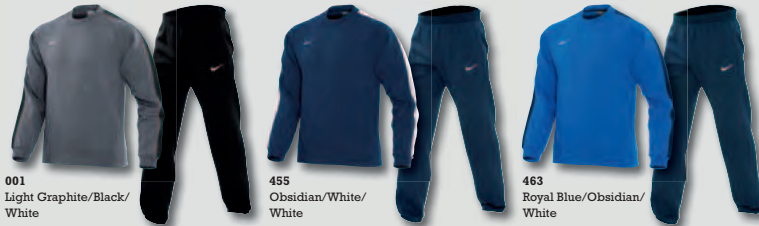
001 Light Graphite/Black/ White