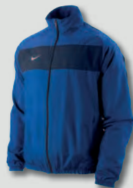
463 Royal Blue/Old Royal/ Obsidian/White