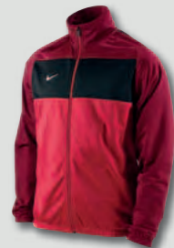
648 Varsity Red/Team Red/Black/White

Your top choice for an on-the-go layer, the Nike Federation II Poly Football Jacket gives you lightweight protection with the athletic profile that you're looking for. • Mock-neck. • Contrast stripes at shoulders and centre front. • Side-zip pockets. • Elastic cuffs and hem. • Fabric: 100% polyester.