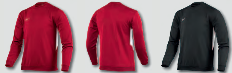
648 Varsity Red/White/Varsity Red/White

Stay insulated while you train in the Nike Team Football Training Top, a long-sleeve design with soft fabric for a comfortable fit. • Rib crew-neck. • Contrast panels at sides. • Rib cuffs and hem. • Fabric: Body: 82% polyester/12% cotton. Rib: 100% polyester.