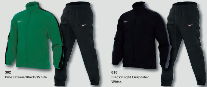
302 Pine Green/Black/White