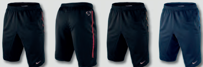
011 Black/Varsity Red/White

A lightweight sport essential with an athletic fit. • Elastic waist with gripper and drawcord. • Side panels with screenprint. • Mesh gusset and yoke. • Fabric: Dri-FIT 100% polyester.