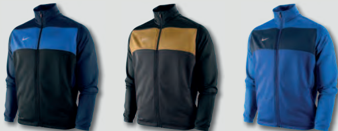
010 Black/Obsidian/Royal Blue/White