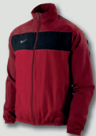
648 Varsity Red/Team Red/Black/White

Show your world-class skills in the Nike Federation II Woven Football Jacket, a lightweight layer in an athletic fit. • Mock-neck. • Contrast stripes at shoulders and centre front. • Side-zip pockets. • Elastic cuffs and hem. • Fabric: Dri-FIT 100% polyester.