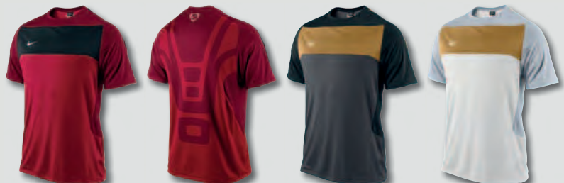
648 Varsity Red/Team Red/Black/White

An ultra-lightweight design with strategic ventilation to keep you at your best. • Rib crew-neck. • Contrast panel at shoulders and centre front. • Mesh side panels. • Mesh back panel with sublimated graphic. • Fabric: Dri-FIT 100% polyester.