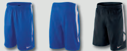
463 Royal Blue/White/White Backview 010 Black/White/White

Coverage and the range of motion that athletes need. • Elastic waist with interior drawcord. • Contrast panel at side seams. • Mesh gusset. • Mesh panel at upper back. • Fabric: Dri-FIT 100% polyester.