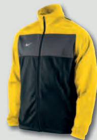
060 Black/Varsity Maize/Antracite/White