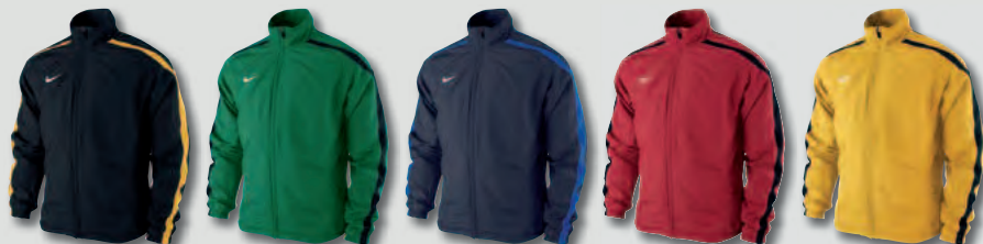
011 Black/Varsity Maize/White