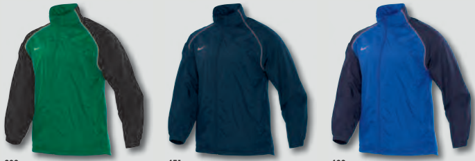
302 Pine Green/Black/White