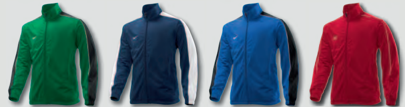
302 Pine Green/White/Black/White