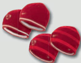
648 Varsity Red/Sport Red/White/White

321681 Men's / MISC RRP € 14 01 Apr 09 - 19 Mar 12