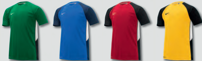
302 Pine Green/Black/White/White