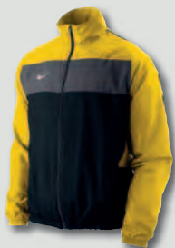
017 Black/Varsity Maize/Antracite/White