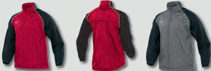
648 Varsity Red/Black/White

A water-repellent must-have, featuring a mobile raglan sleeve design and plenty of ventilation. • Packable hood at mock-neck. • Contrast piping at raglan seams. • Side-zip pockets. • Mesh vent at upper back. • Bungee-cord and toggle at hem. • Mesh lining. • Fabric: 100% polyester.