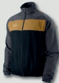
010 Black/Antracite/ Jersey Gold/White