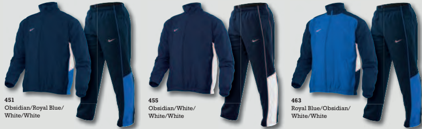
451 Obsidian/Royal Blue/ White/White