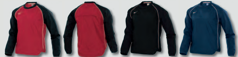
648 Varsity Red/Black/White

A water-repellent outer layer with mobile raglan sleeves and a lightweight fit. • Rib crew-neck and cuffs. • Contrast piping at front and back raglan seams and side. • Mesh vents under arms and at back. • Mesh lining. • Bungee-cord and toggle at hem. • Fabric: 100% polyester.