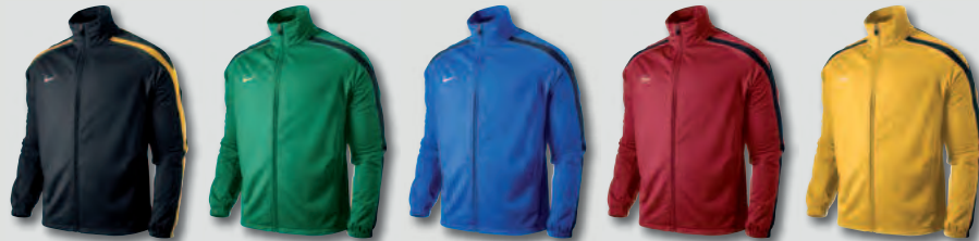
011 Black/Varsity Maize/White