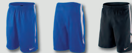
463 Royal Blue/White/White Backview 010 Black/White/White

Coverage and the range of motion that athletes need. • Elastic waist with interior drawcord. • Contrast panel at side seams. • Mesh gusset. • Mesh panel at upper back. • Fabric: Dri-FIT 100% polyester.