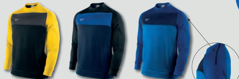
017 Varsity Maize/Anthracite/White