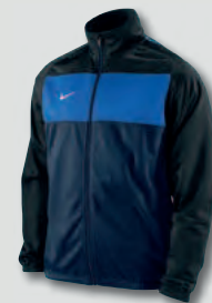
451 Obsidian/Black/Royal Blue/White