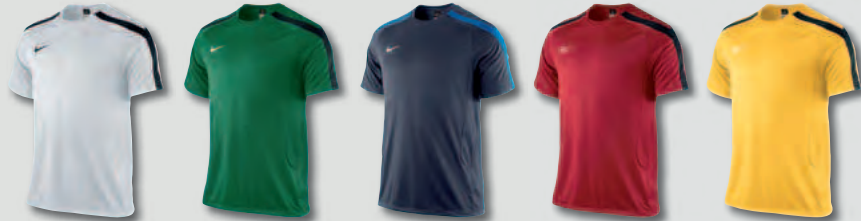
100 White/Black/Black 302 Pine Green/Black/White 451 Obsidian/Royal Blue/White 648 Varsity Red/Black/White 703 Varsity Maize/Black/White