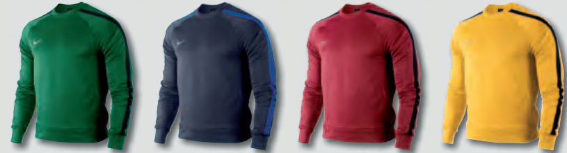
302 Pine Green/Black/White 451 Obsidian/Royal Blue/White 648 Varsity Red/Black/White 703 Varsity Maize/Black/White