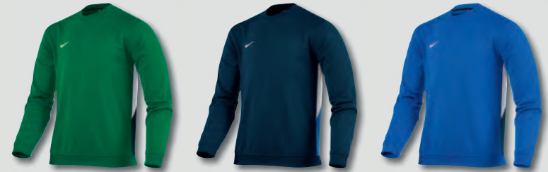
302 Pine Green/White/Black/White