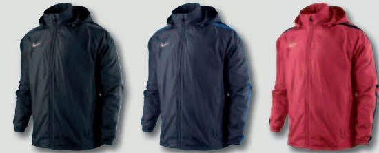
010 Black/Light Graphite/White