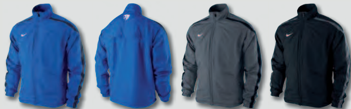
463 Royal Blue/Obsidian/White