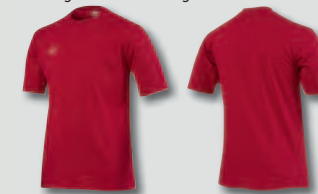
648 Varsity Red/White

Show your winning ways with pride in the Nike Team Football T-Shirt, a solid statement of victory in a comfortable fit. • Rib crew-neck. • Swoosh design trademark at right chest. • Fabric: 100% cotton.