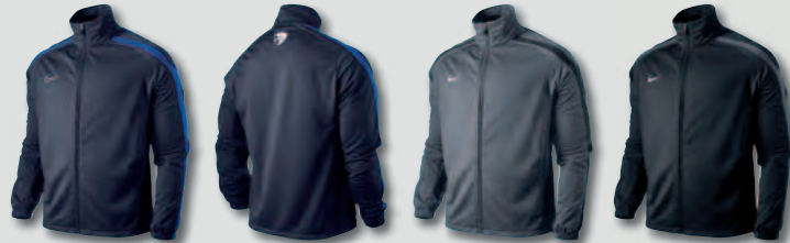
451 Obsidian/Royal Blue/White

This jacket is a game-changer. • Contrast inset panels at shoulders and sleeves. • Side-zip pockets. • Elastic cuffs. • Adjustable hem with bungee cord and toggle. • Fabric: Dri-FIT 100% polyester.